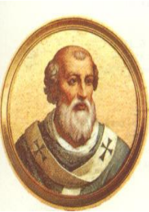
Pope Stephen V (885-891 A.D.):

St. Paul the Apostle : “Now the works of the flesh are manifest: which are fornication [premarital sex], uncleanness, immodesty [bikini’s; short skirts/pants etc.], luxury, Idolatry, witchcrafts [Satanists; Wizards; Witches, etc.], enmities, contentions, emulations, wraths, quarrels, dissensions, sects [false churches/religions], Envy, murders [abortionists], drunkenness, revellings, and such like. Of the which I foretell you, as I have foretold to you, that they who do such things shall not obtain the kingdom of God ” (Galatians 5:19-21).